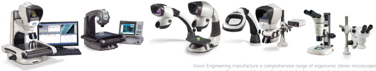
Vision Engineering manufacture a comprehensive range of ergonomic stereo microscopes as well as a complete line of optical and video non-contact measuring systems.